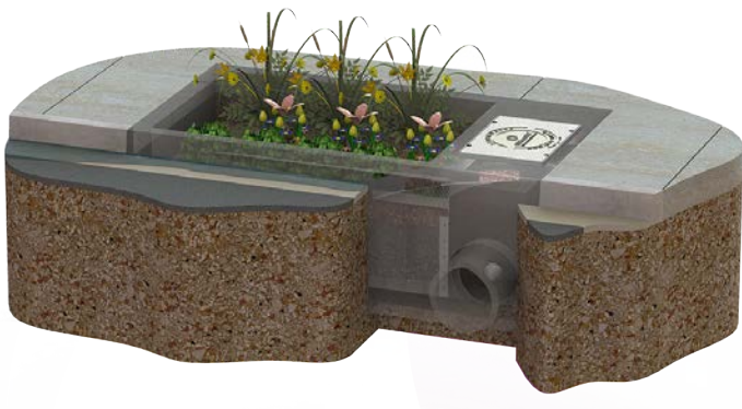
BioPod Planter Module