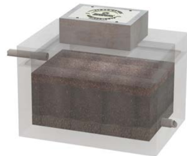
BioPod Media Vault