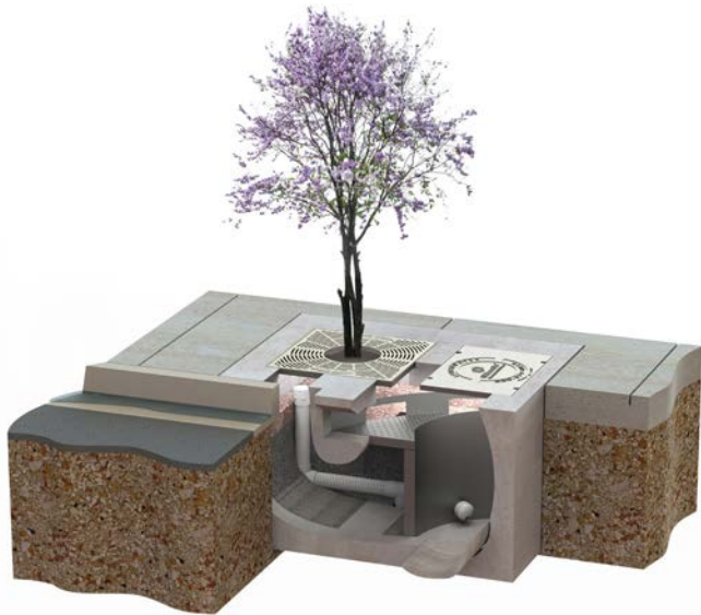
BioPod Tree Module

Natural, shredded hardwood mulch should be used in the BioPod. Timely replacement of the mulch layer according to the maintenance indicators described above should protect the biofiltration media below the mulch layer from clogging due to sediment accumulation. However, whenever the mulch is replaced, the BioPod should be visited 24 hours after the next major storm event to ensure that there is no standing water in the biofiltration chamber. Standing water indicates that the biofiltration media below the mulch layer is clogged and must be replaced. Please contact Oldcastle Stormwater at (800) 579-8819 to purchase the proprietary StormMix™ biofiltration media.