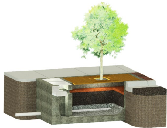
Bypass Weir Model