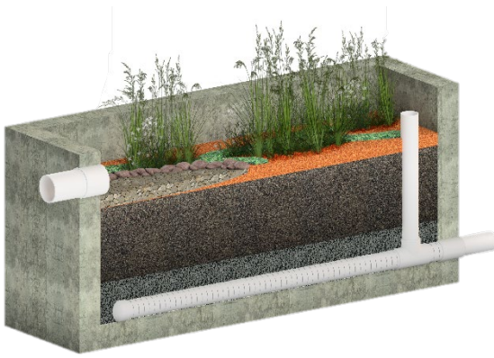
Planter Box Model

The following illustrations depict various possible deployment configuration models of the SVBF unit.