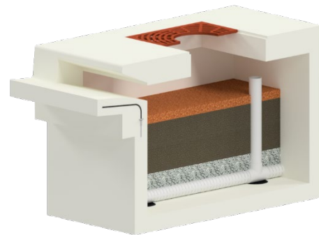
Tree Box Model with Curb Inlet